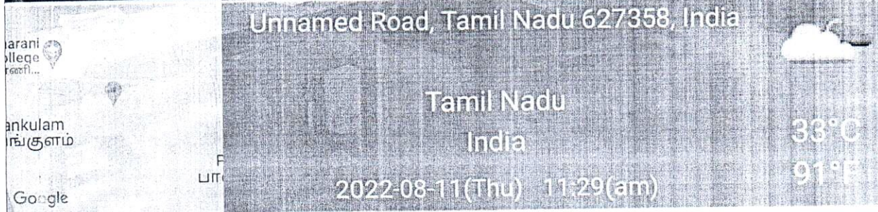
Fig. 1 Training Session