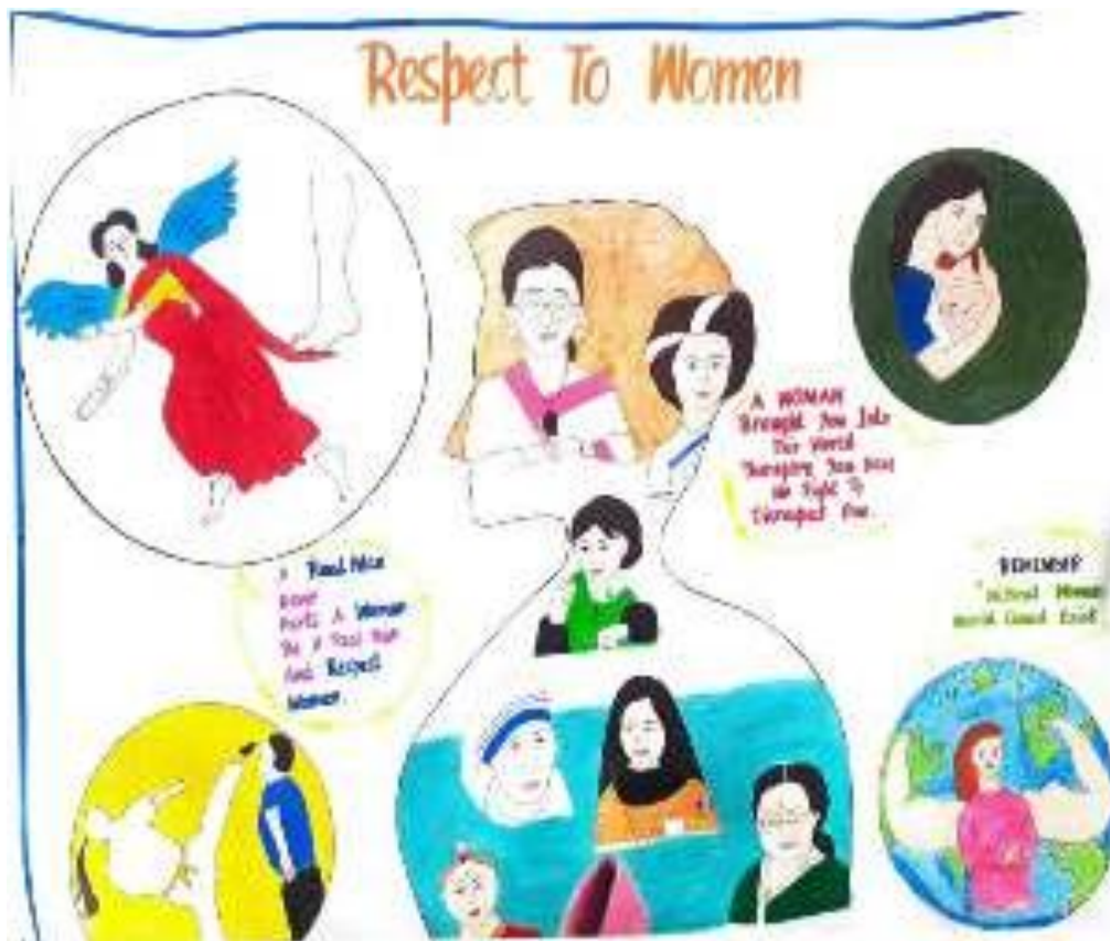
Chart Displaying Competition “Respect to women” on 28.01.2020. Students become more creative.